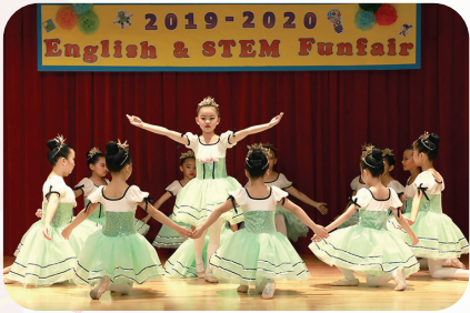
Elegant Ballet Performance