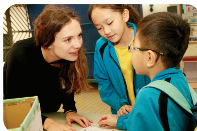
Versatile Booth Games