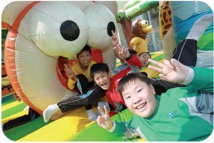
Exhilarating Jumping Castle