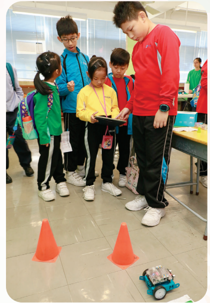
Experimental Robotic Programming and Control