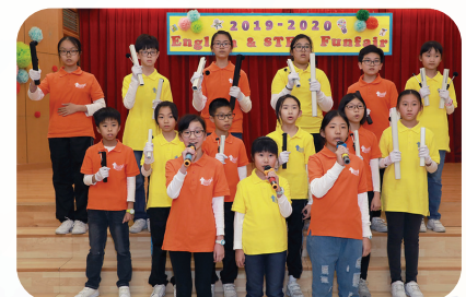
Amazing Worship Team