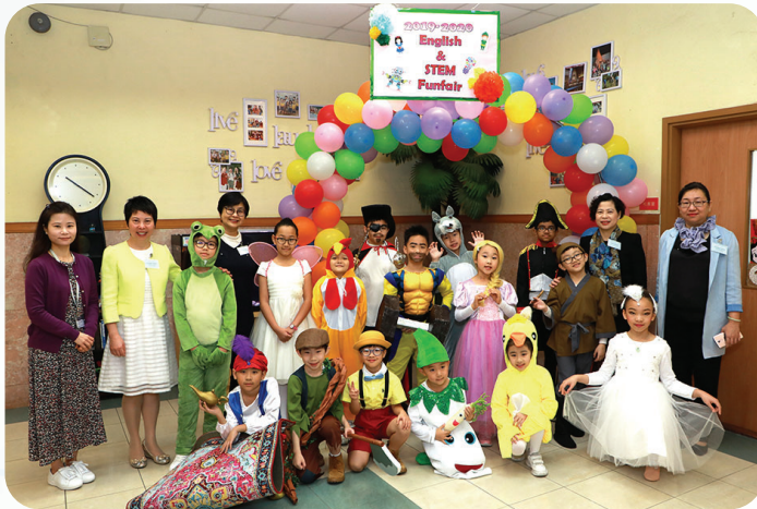
A memorable moment with kindergarten principals

Secondary school principals and teachers pose with a total of 18 shortlisted contestants from the Catwalk Show dressed up in a fairy tale themed costumes and narrated children's stories whilst portraying their favourite characters.