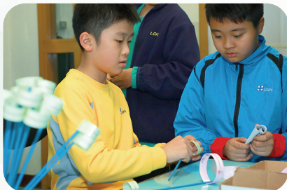
Creative Paper Plane Construction