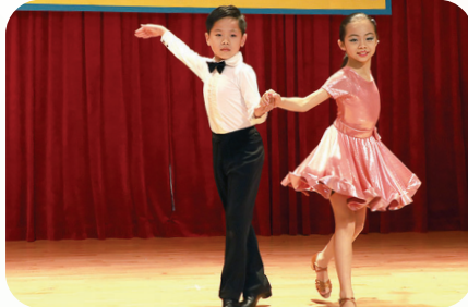
Rhythmic Latin Dance