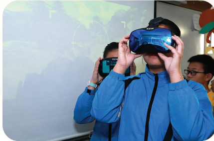
Stimulating Virtual Reality